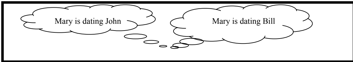
Fig. 2: My relevant epistemic alternatives in Scenario 2.

The sentence in (5) (repeated below as (7)) can felicitously describe Scenario 1, but not Scenario 2.